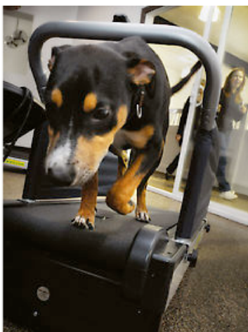
Sadie gets a workout at Pant, the fitness centre in the hotel.